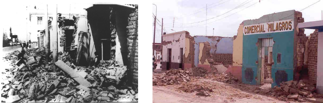
Fig.1. Collapse of traditional adobe houses due to severe earthquakes in Peru.

goal was to find a way to prevent the sudden collapse of traditional adobe houses during earthquakes, which usually cause human casualties and loss of properties (fig. 1). The main objective was to provide the adobe house with the enough seismic resistance, so that the habitants could get out before it collapsed.