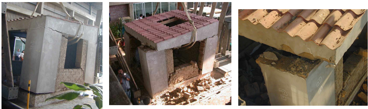
Fig. 8. Behavior of the module during the catastrophic earthquake simulation test (left), after the test (middle), and failure of the plain concrete shear key (right).

A conclusion driven from this test was that the seismic behavior of the proposed system for reinforced adobe houses could be still improved, in order to withstand even catastrophic earthquakes. The new features could include vertical dowels to connect the foundation with the wire mesh strips, reducing the rocking observed, and on the other hand, reinforcing the upper key with vertical dowels, to control the shear friction failure observed (fig. 8).