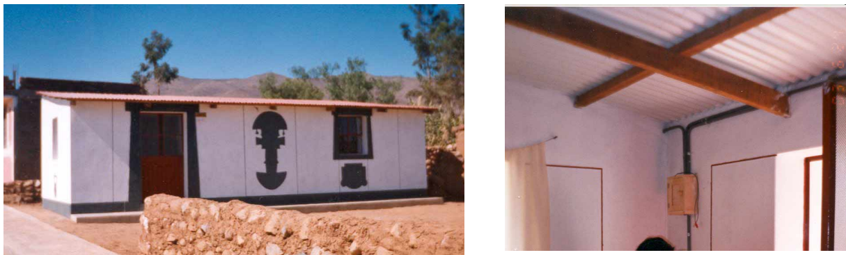
Fig. 9. New adobe house built by PNUD-SENCICO.

In this program, almost 100 adobe houses have been constructed, following the module plans initially developed by the COPASA-SENCICO-PUCP team. Most of these houses have the roof with a single slope, and only a few have a two-sloped roof. The roof cover is of metal sheets. In fig. 9 some of the houses of this project are shown, in which it can be observed the correct location of the visible electrical installations by the outer side of walls and roof, in order to keep the structure intact.