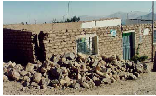
Fig.5. Reinforced house and unreinforced neighbor houses after the 2001 earthquake.