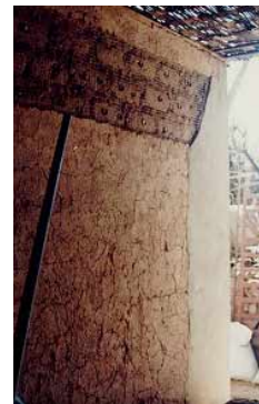
Fig. 4. Reinforcement for existing 2-story houses.