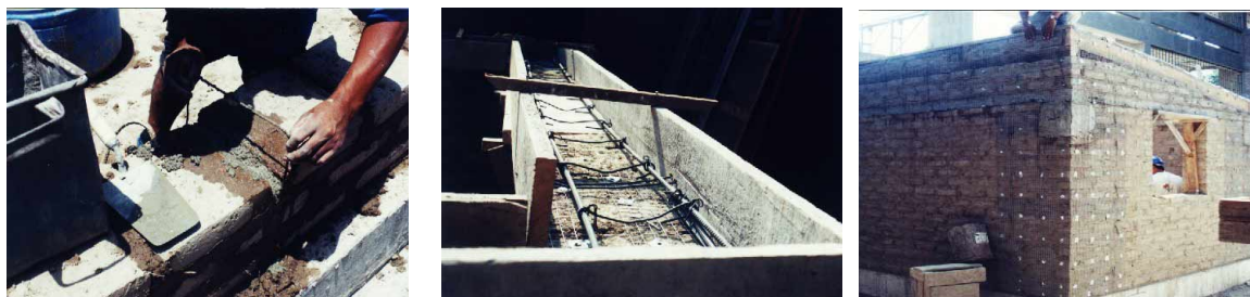
Fig. 7. Some structural improvements in the new adobe houses: wire connector in joint (left), collar beam (middle), and shear key (right).

Some of the structural improvements, designed at PUCP, are indicated in fig. 7, and include the following: 1) use of plain concrete for the foundation; 2) the construction procedure, like the wetting of the adobe units before placement, the use of a marked stick to control the 2 cm joint width, the installation of the connector at the vertical joints covered with cement mortar; and, 3) the collar beam of poor concrete ( f'_c=10 MPa), used as lintel in doors and windows, reinforced with two #3 bars.