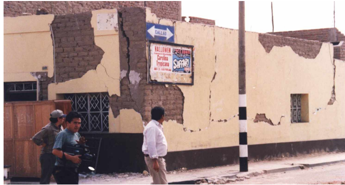
Fig. 2. Typical cracks on adobe houses due to out-of-plane seismic forces.