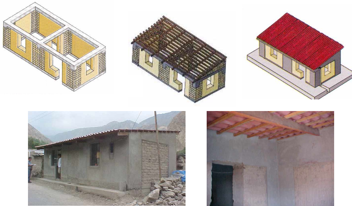
Fig. 6. Views of the new reinforced houses built in Arequipa.

The basic module architecture is shown in fig. 6, in which the vertical strips of wire mesh covered with mortar may be appreciated. The module was conceived in such a way that could be adapted to different areas and that future modules for expansion could be added by duplicating this basic module.