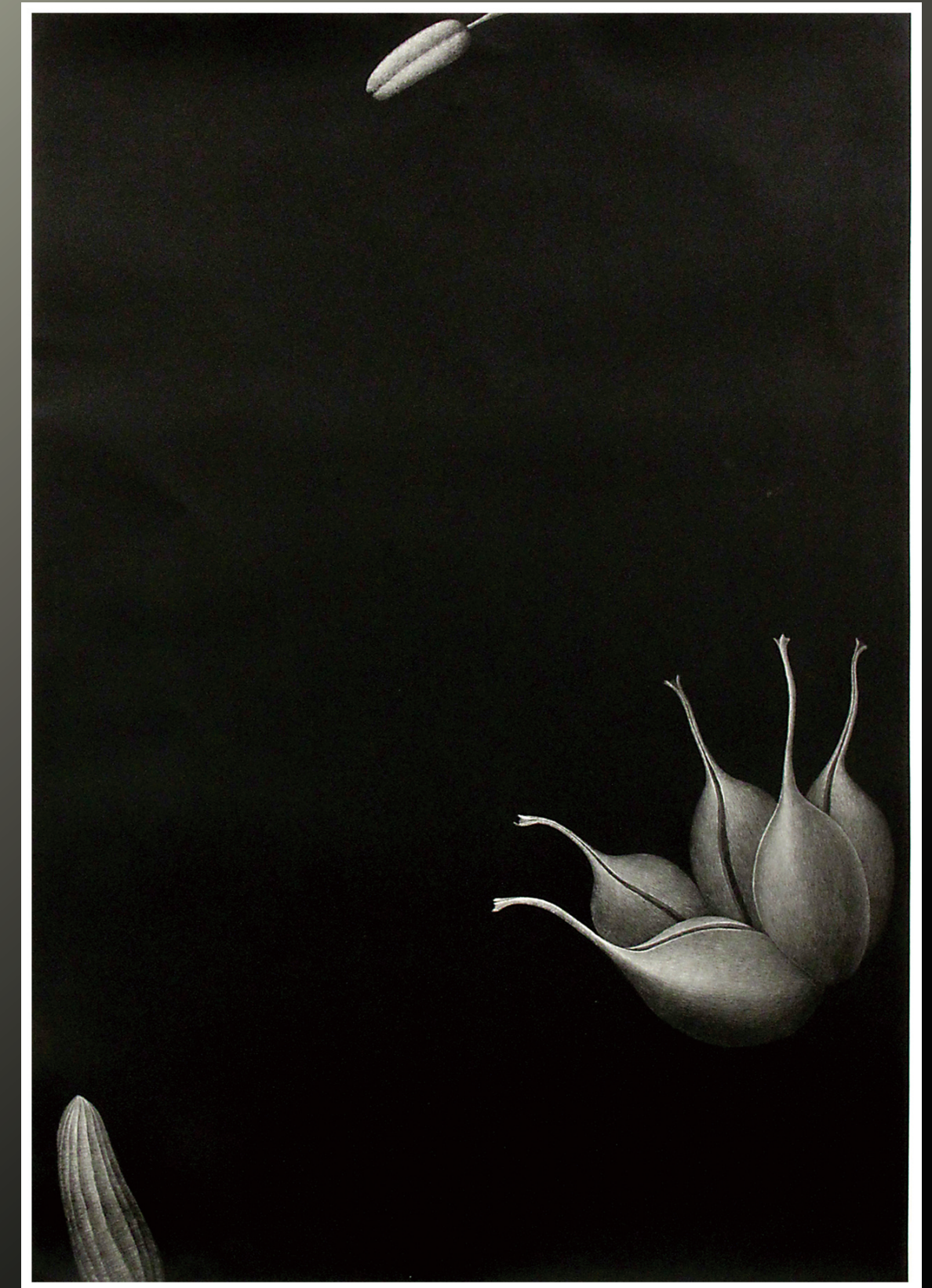
第8回大賞作品 [Essence, Truth, Reality No.8 / Boonmee Sangkhum / タイ]