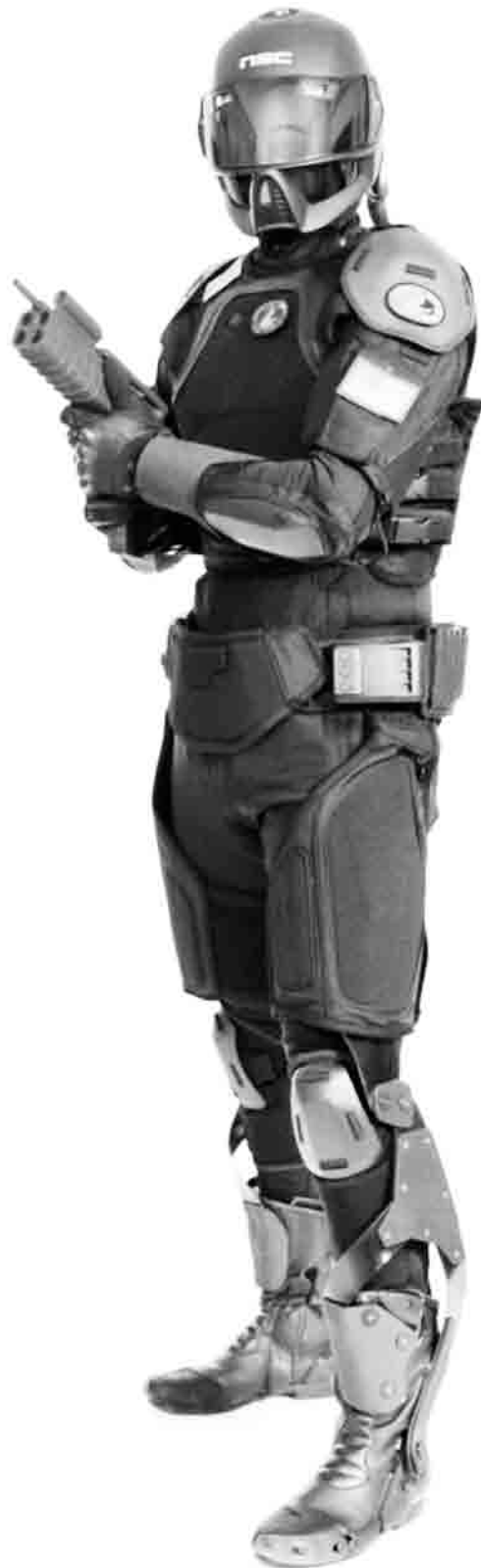
Researchers are working on ways to add robotic enhancements to human soldiers, as in this Future Warrior Concept. One exotic possibility: super-strong “nano-muscle” fibers sewn into suits, boosting soldiers’ strength.

The most controversial role for robots in the future would be as replacements for the human grunt in the