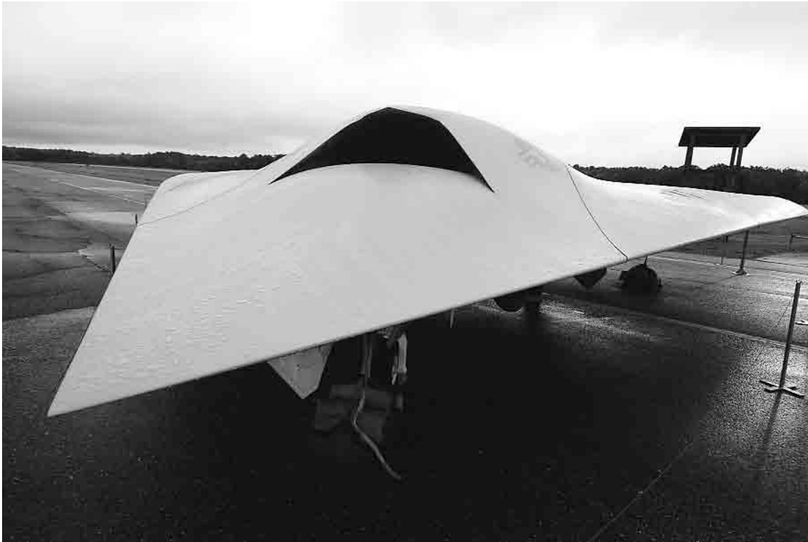
The Navy's unmanned X-45, an attack and surveillance drone shown here in prototype, may spell obsolescence for fighter pilots one day.

The most dramatic instance of a failure to override occurred in the Persian Gulf on July 3, 1988, during a patrol mission of the U.S.S. Vincennes . The ship had been nicknamed "Robo-cruiser," both because of the new Aegis radar system it was carrying and because its captain had a reputation for being overly aggressive. That day, the Vincennes's radars spotted Iran Air Flight 655, an Airbus passenger jet. The jet was on a consistent course and speed and was broadcasting a radar and radio signal that showed it to be civilian. The automated Aegis system, though, had been designed for managing battles against attacking Soviet bombers in the open North Atlantic, not for dealing with skies crowded with civilian aircraft like those over the gulf. The computer system registered the plane with an icon on the screen that made it appear to be an Iranian F-14 fighter (a plane half the size), and hence an "assumed enemy."