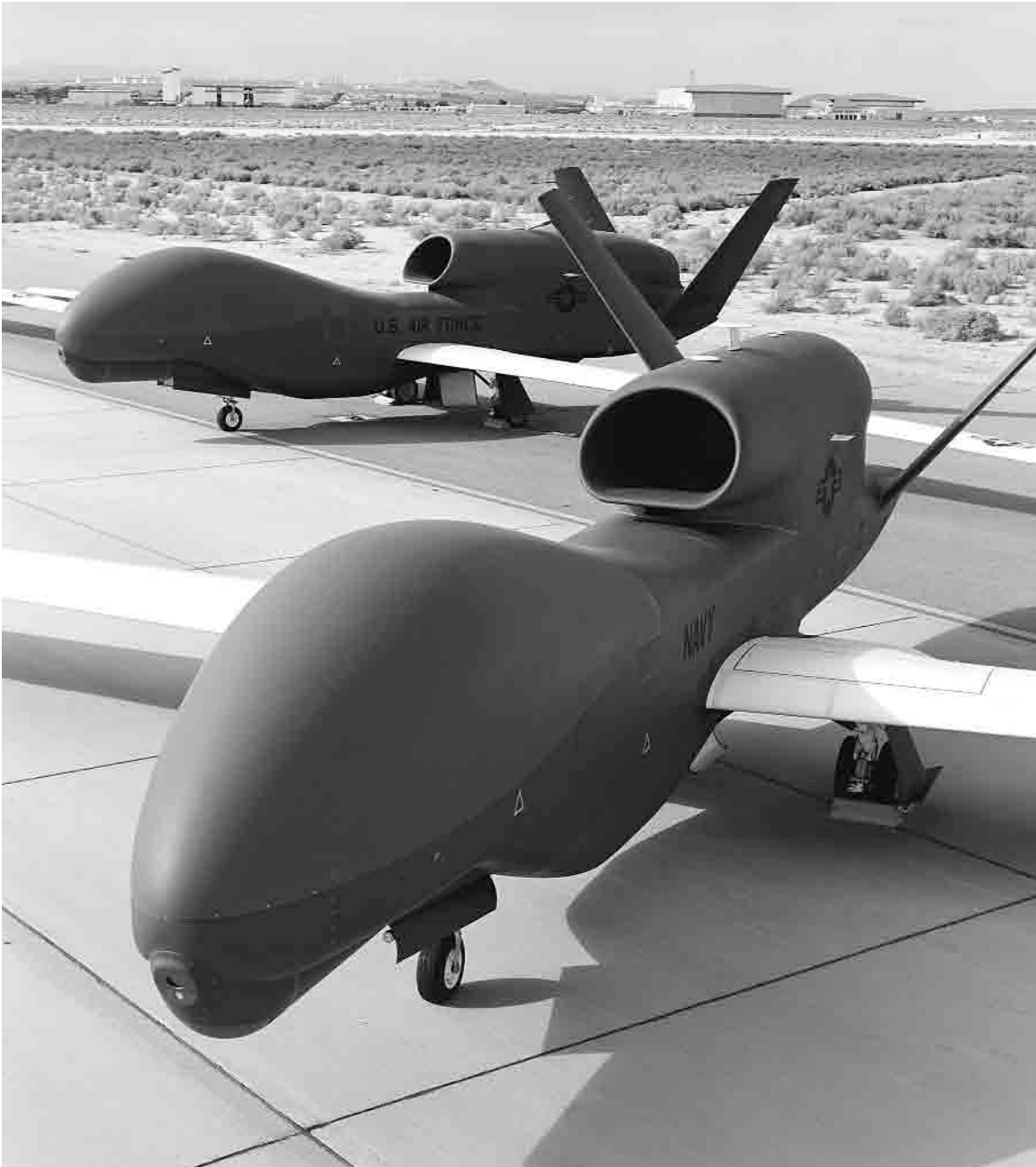
The eerie Global Hawk surveillance drone, only 44 feet long, can travel thousands of miles at altitudes of up to 12 miles virtually without human control.

Hawks zoom across much larger landscapes at 60,000 feet, monitoring electronic signals and capturing reams of detailed imagery for intelligence teams to sift through. Each Global Hawk can stay in the air as long as 35 hours. In other words, a Global Hawk could fly from San Francisco, spend a day hunting for terrorists throughout the