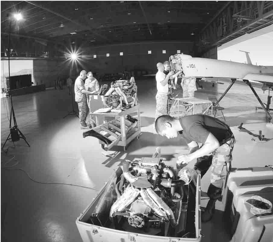
At Creech Air Force Base in Nevada, maintenance personnel work on a Predator. Within the military, unmanned systems are altering command structures and human-machine relations. Some ground troops have even complained that Nevada-based Predator pilots value the machines' safety over soldiers' lives.

ing war, rather than citizens sharing in its importance.