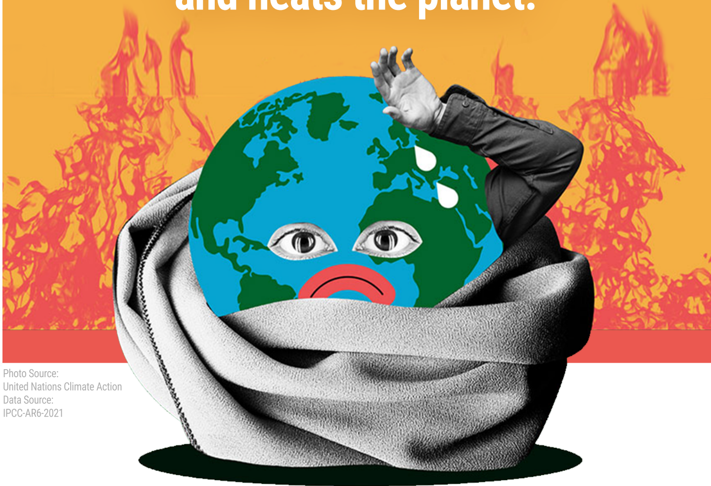
Photo Source: United Nations Climate Action Data Source: IPCC-AR6-2021

CO 2 has created an invisible, human-made blanket that traps heat and heats the planet.